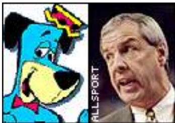
Separated at birth?