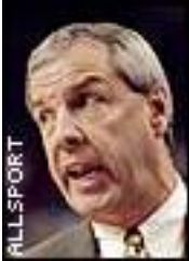
"He didn't beat me!"