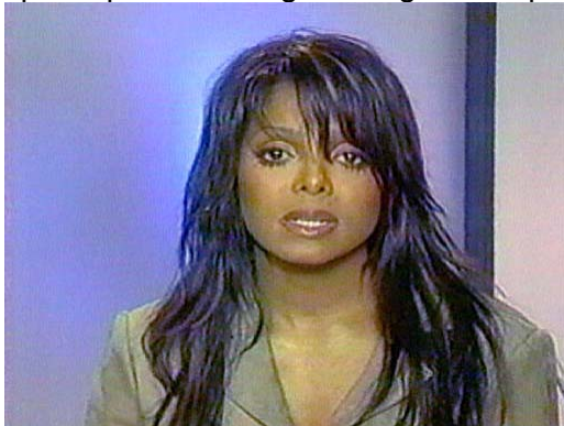
Chad Johnson stole my job!

Pepto-Bismol is manufactured by Cincinnati-based Procter & Gamble Co., which is donating money to the National Breast Cancer Foundation for each touchdown the Dentist scores in October. P&G rejected an offer from Janet Jackson to act as their spokesperson, citing her negative exposure.