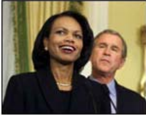
Commissioner Rice likes Jeffy

Brown Rice spoke to the Browns after practice, telling them "to go beat the Bengals." She grew up rooting for the Browns in rural Alabama and maintains her love to this day. She spent a lot of time watching Jeff Garcia when she was at Stanford, and she likes him as a quarterback and beyond. "I know Jeff is dating that Penthouse chick right now, but after November 2 nd my dance card is wide open. I am hoping he will throw the ball through my tire, just like on the Viagra commercials. "