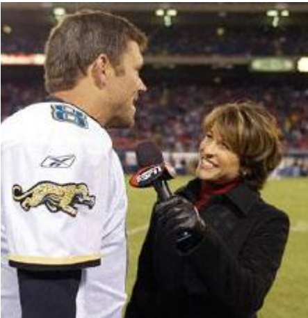
A sober Mark Brunell keeps his eye on the ball...