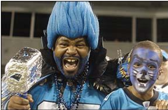
Crime fighter or boxing promoter?