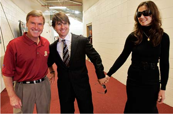
TomKat with a ventriloquist dummy at FedEx Field

Rookie Swedes head coach Brad Childress game planned like a Hall of Famer in this one. Former GVs QB Brad (Jr) Johnson won the battle of the oldest QBs in the league with a virtuoso performance. He threw the rock through a keyhole more than once, and only big drops by Troy Williamson kept the Vikes from pillaging Old DC.