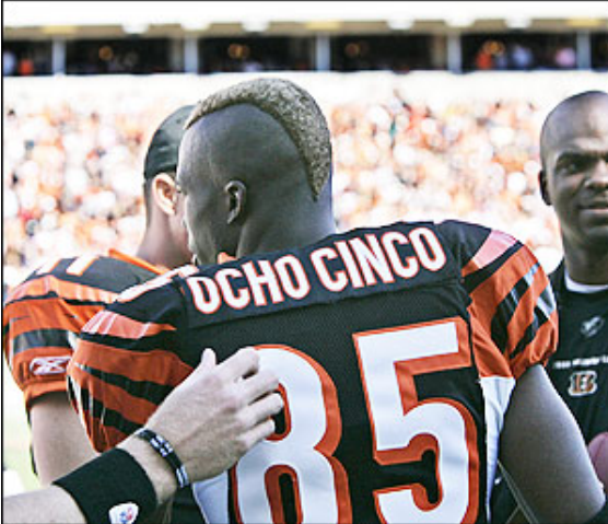
Bengals misspelled "Stinko" for the Dentist