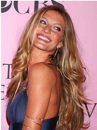
Celebrity girlfriend = Loss

Despite the fact that the Look Man has never given Eli his due, the Kid is playing well at the right time. Plus, his girlfriend is not Gisele Bunchen!