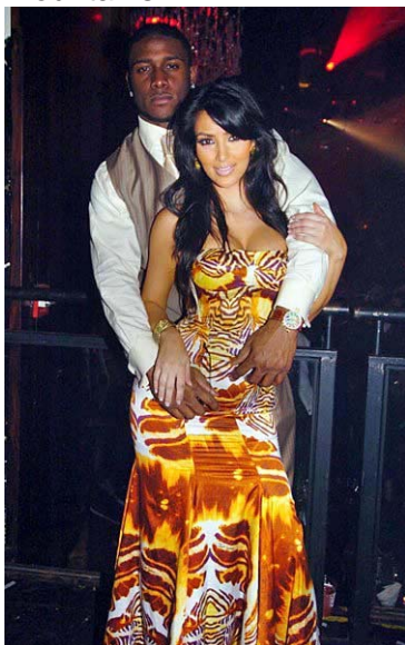
Reggie & Kim at Sundance

Reggie's celebrity shorty, Kim Kardashian appeared in the recent holiday edition of Playboy magazine, and has a cable TV show. Mike Wilbon's favorite piece of ass got 12 pages of coverage, and she will likely show up in Scottsdale this week. Kardashian joins Paris Hilton, Jessica Alba and other celebrity hotties in the Desert, adding some scenery in the foothills of the mountains.