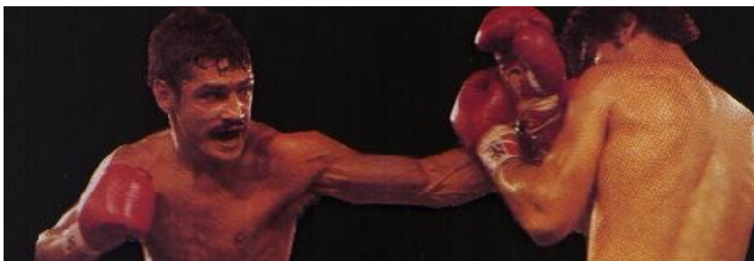
How 'bout dem Cowboys?!