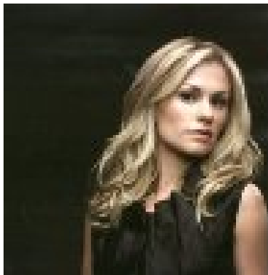
Pacquin: Almost famous?

While writers have played up the sensuality of vampires since the introduction of Bela Lugosi, Ball takes it to new heights. Catch the back episodes if you can. Unlike the characters, they don't suck.