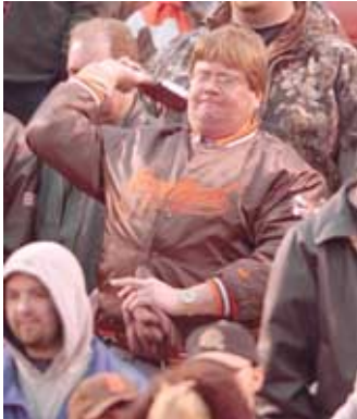
Aiming for Derek Anderson?