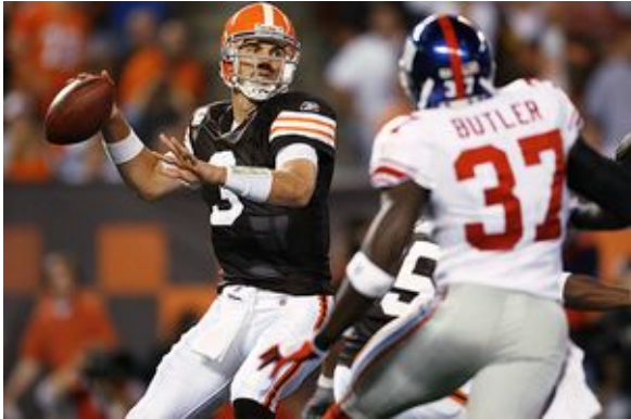
Slaughter the white rabbit Neo...

that they can build on that confidence. After all, they will be on the national stage three more times, and no one wants to see bad football.