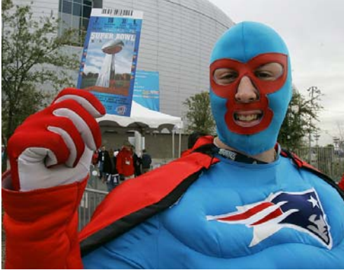
A superhero can dream, can't he? Go Chowds!