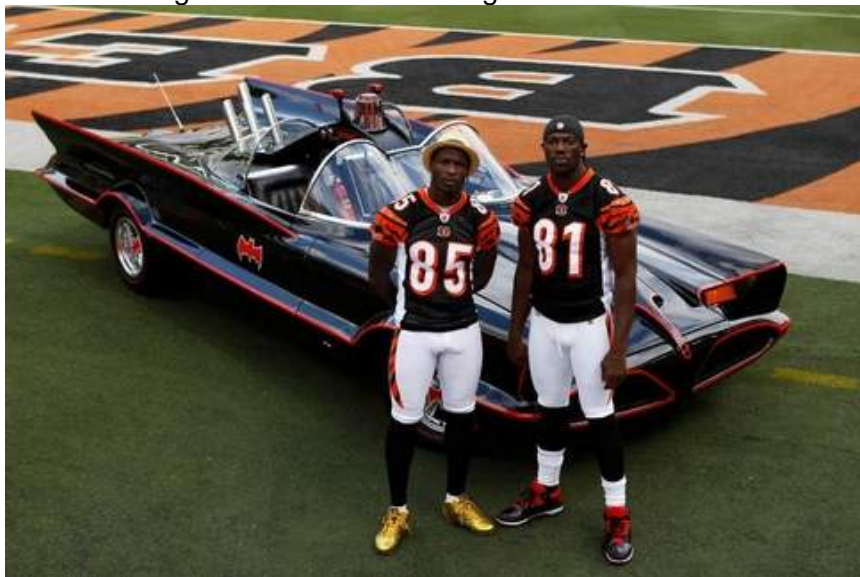
"To the Locker Room, Old Chum!" "Holy halftime, Batman!"

Still, the Nati punked the Ducks twice in 2009, and Baltimore didn't like it one bit. The Dumpster Ducks are on a revenge tour, and chalk up two in a row this week. Ducks win; Bengos go back to the drawing board. Same old Beng-os.