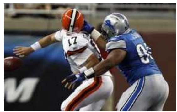
Yup, that's a foul all right.

Further, simply tackling a QB is not illegal while pile-driving is a no-no. The NFL needs to take some of the onus off the zebras, especially in division games where a little more physical play is warranted. Otherwise, we may as well have transvestite attire on the signal callers.