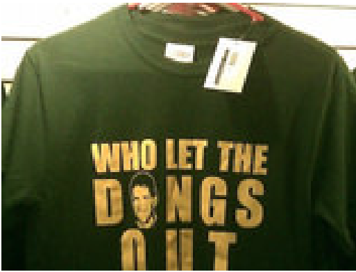
Limited edition sold with audio CD...

Brett's a Wranglers man, always was, always will be, but he only threw nineteen times in the win over Dallas. He'll throw about the same this week in a Vikes win. Vikes, baby, Vikes.