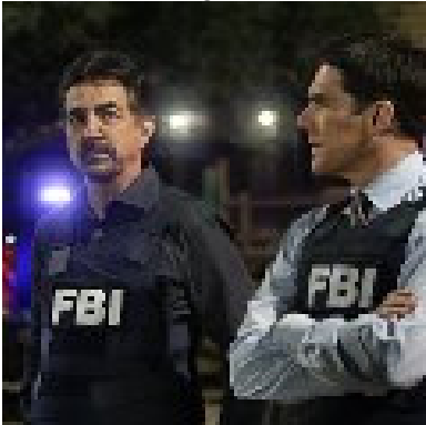
"I heard you found Branch doing porn in Bellingham."

The Bolts don't match up well against a balanced attack as indicated in losses to Oakland and KC. The Chowds may get caught up in the Look Ahead factor with Randy Moss returning to town in Week Eight. Push.