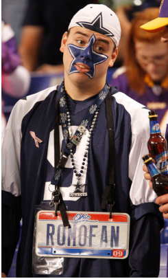
The aforementioned WPF...