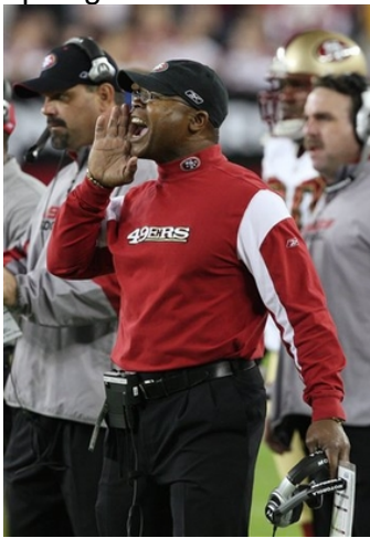
"I HATE this kinda pahty!"

These two hook up big time across the pond, and Denver coach Josh McDaniel again apologizes to his fans and his owner. Frisco.