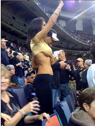
New Orleans' home field advantage?

The Look Man would like to see the Icons take this one, but there is too much offense in Blitzburgh. Stillers win, setting up a nice Monday Nighter with the Bengos. Stillers.