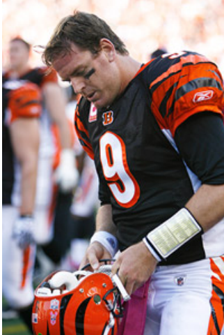
"Tommy John? I thought you said Obi Wan."