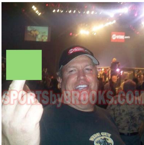
Sexy Remy to NFL zebras following last week

The Lions woes are legendary, and the Jets need a win. The Jets get some zebra love to make up for last week. J-E-T-S cover in a wild one.