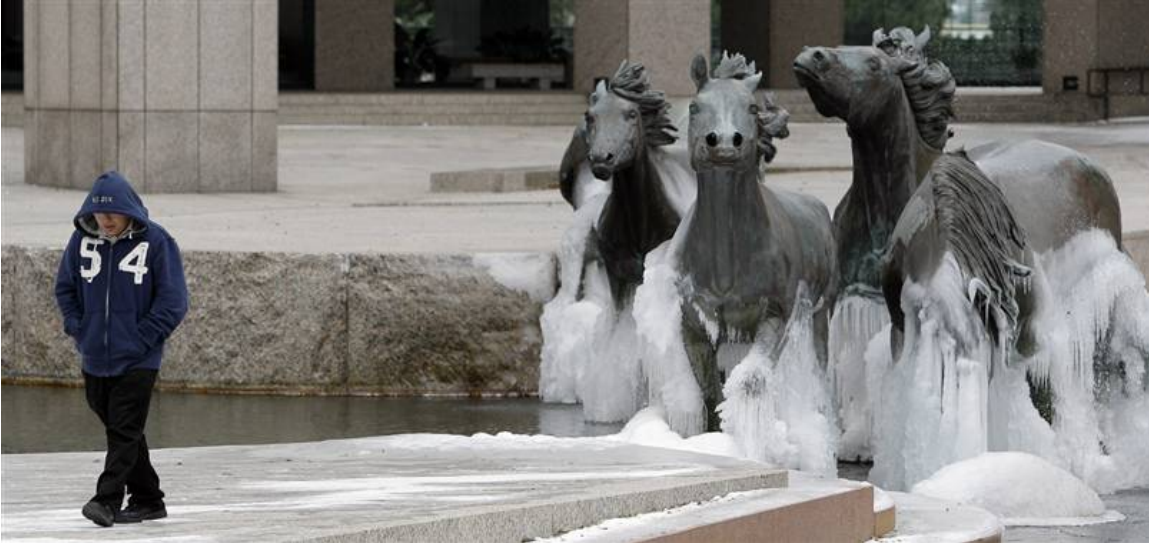
Chuck Howley reporting live from Irving, TX or the North Pole?