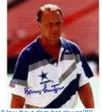
"How 'bout dem hot dawgs?!!"