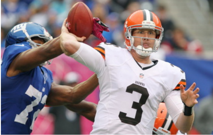
Can you count to two?