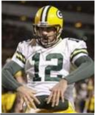
"Are you a dancer?"