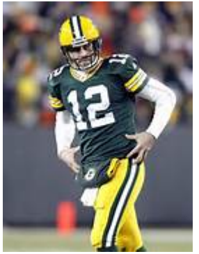
"Can I move to grill class?"

Look for Cheeseheads to beat the Bears in a closer game than the spread. Bears cover, Pack wins.