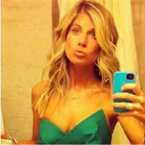
Selfie for Tinder?

Seattle wins, and the Pokes looking ahead to a Week Seven Five NFC Beast game against the surprising G-Men. We may even see former Browns QB Brandon Weeden's Pokes debut. Seattle.