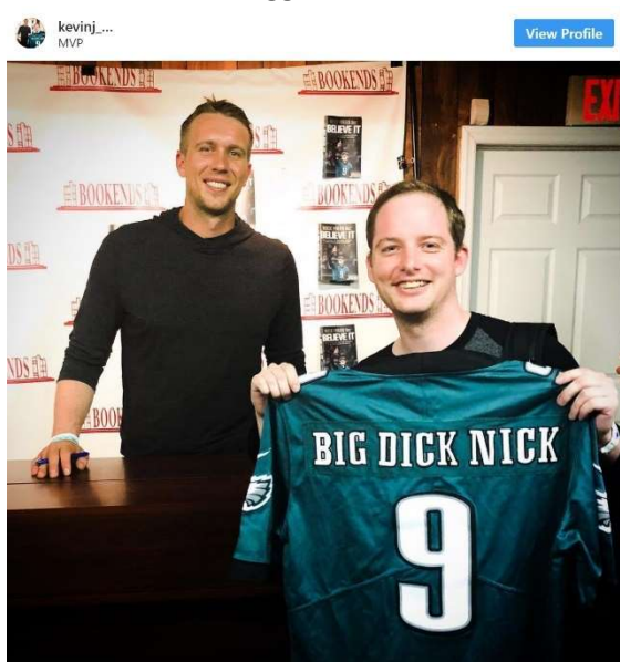
BDN and friend. Who knew?

New Orleans unproven receivers fold under the playoff intensity, giving the Iggles a rematch with the Rams in Week 19. Iggles.