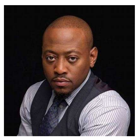
"We live in our hopes, not in our fears..."

This is one of those games in which the Zebras affect the outcome, preserving New England's slim hopes for a bye week. The Zebras screw the Bisons, resulting in a weird, striped genus known as Bison Zebronus . Stillers.