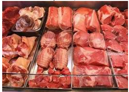
"These cuts look fine to me..."