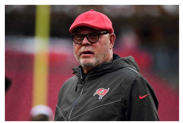
"I'm getting too old for this sh!t..."