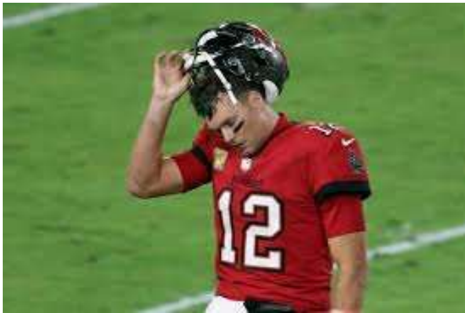
"Tawmmy, a Teddy Bear broke into yaw house in Brookline again."

The NFL is still in the Tom Brady business, and this game may decide whether Zoolander makes the postseason. Tampa is coming off of a late bye week for a playoff run with a guy who has six Lombardi's, four Super Bowl MVP rings, and three NFL MVP awards. Tampa.