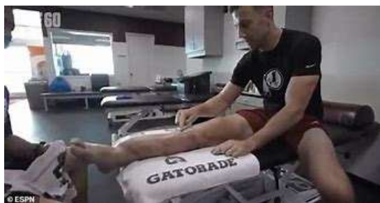
Mister Smith could be the DC starter on Sunday with this leg...