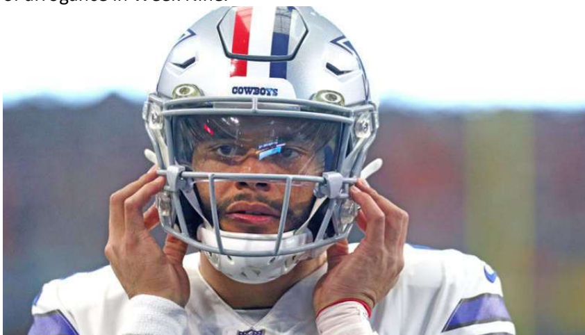
America's QB – Dak Prescott?

The Dak MVP discussion is really just part of the odd national obsession that the Pokes are America's Team. They have roughly the same number of playoff wins as Cleveland over the last twenty years, despite being in a division that absolutely stinks. And those red, white and blue helmets were the height of arrogance in Week Nine.