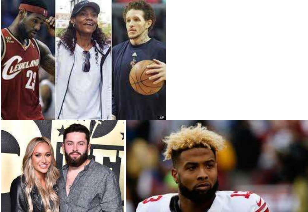
The Delonte Effect strikes again in C-Town...