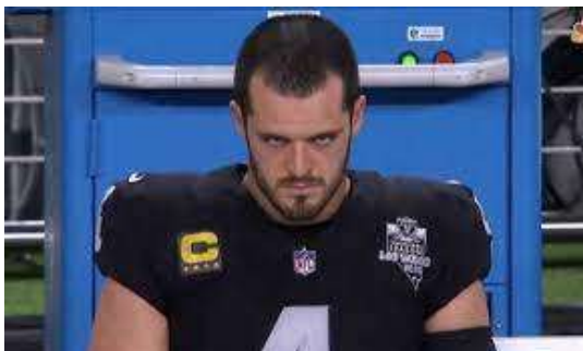
“It’s all about the ball. That’s why we lost. Please. Just talk about me turning the ball over.” – Raiders QB Derek Carr after a pick six and a cover-your-eyes ugly performance at the Meadowlands.

Vegas just signed WR DeSean Jackson, creating speed matchups deep, and they already have the best TE in the AFC in Darren Waller. Vegas covers and wins at home, throwing the Chiefs into turmoil for a Week Eleven matchup at Dallas. Raiders.