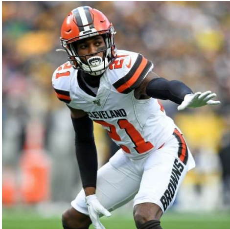
D-Ward in Training Day