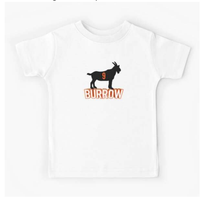
Burrow is a goat, but not The GOAT - - - yet.

The rest of the AFC had better take notice, because if this continues, the road to the Super Bowl might detour through the Nasty Nati.