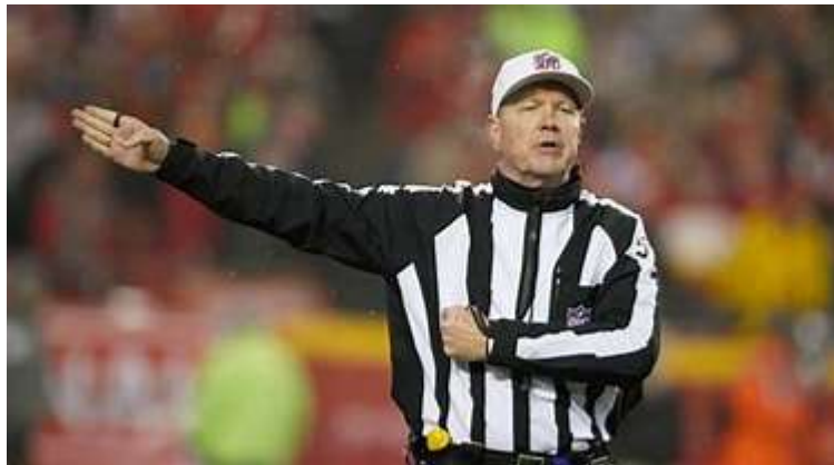
The Old Guard calls the Conference Finals this week