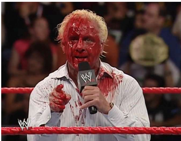
Brady may have had a point about the roughing call...

The Look Man is reluctant to get too upset over the omission given Brady’s history, which includes Hulk Senior exclaiming, “Leave Tom alone!” after one defender’s hit. If Brady had ever been hit as hard as Joe Burrow in the Bengals-Flaming Thumbtacks game, some defender would be serving a life sentence right now.