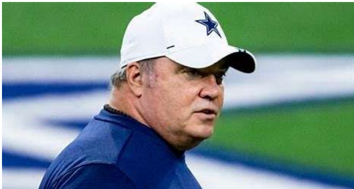
This man helms America's Team????

The Look Man isn't saying something is amiss with NFL coaching hires...oh wait, yes, he is.