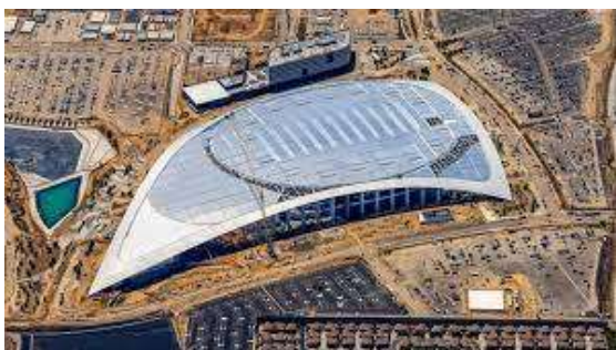
SoFi, aka Earth Final Conflict Stadium

This game is way too close to call. Granted, LA has the bigger names on defense, but Cincinnati is the new No Name Defense. These guys have shut down KC, Tennessee and Vegas en route to the Big Game. Plus, (Jackpot) Joe Burrow vs. Matt Stafford should be epic. The game could go many ways, but the Look Man is counting on a fantastic outing by both clubs.