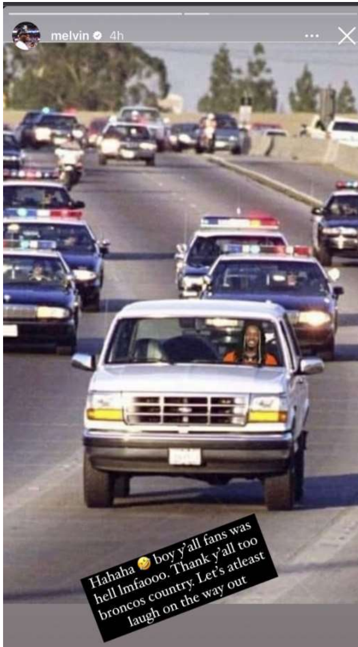
"Stay classy San Diego..."