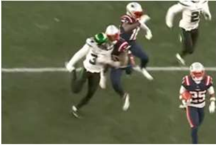
The spread was Jets+3...final score 10-3 Chowds

Jets at Chowds - Carl Cheffers: the game was tied at 3-3 before a miraculous (and illegal) 84-yard punt return with seconds remaining. The return featured not one but two illegal blocks in the back, and the final one by former Browns LB Mack Wilson was clearly a foul. Needless to say, the spread ended in a push, meaning Vegas wins, and everyone else was cussing. Chowds went on to win their fourteenth straight over the Jets, largely courtesy of QB Zach Wilson, who stunk.