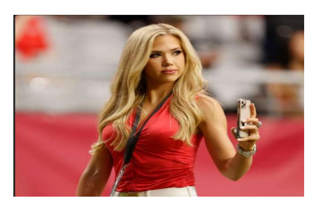
"Say goodnight, Gracie"