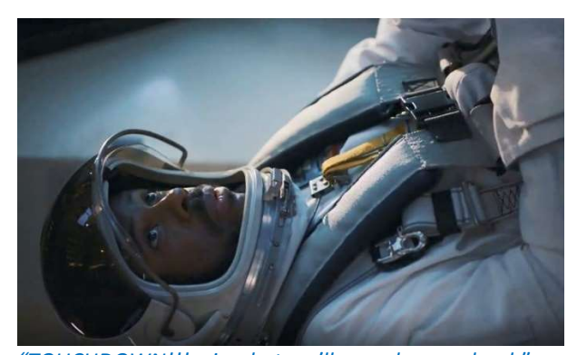
"TOUCHDOWN!!! ...is what we'll say when we land."