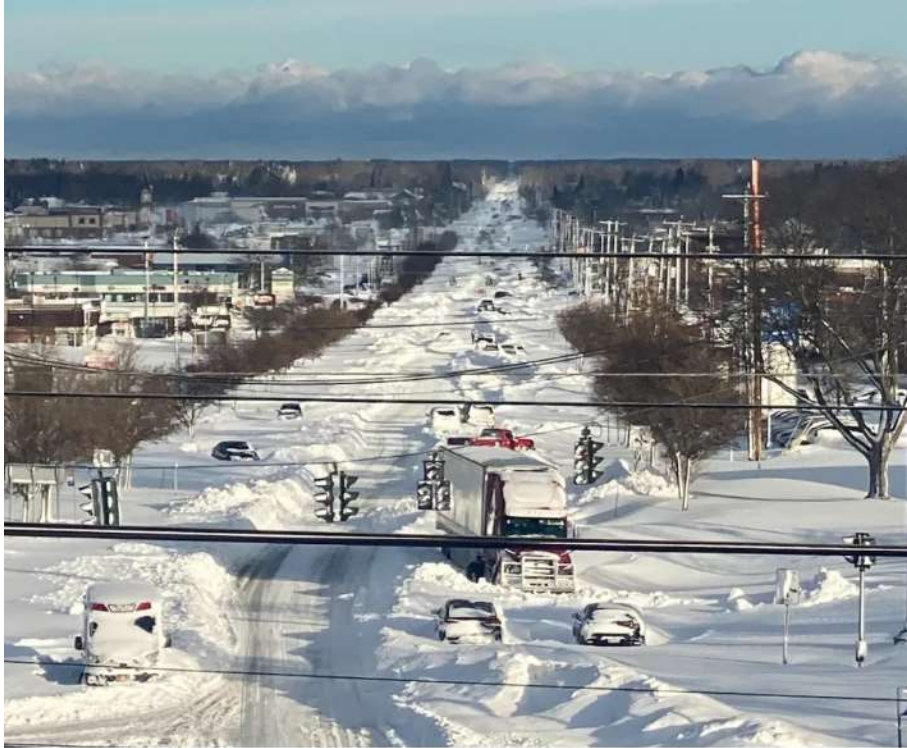
Photo from Crapchester taken on December 25, 2022.

About 30 people were forced to spend part of their Christmas weekend in a Target store while they waited out the blizzard that crippled Buffalo. One woman was head to pick up family members when the journey home became treacherous.