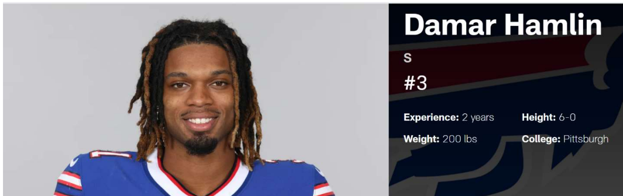
Hamlin in happier times...

The outpouring of positivity and the trainers and doctors at UC Medical saved the day. The storyline is evolving, and it looks as if Hamlin will make a full recovery. Better yet, his foundation has garnered $8 million to date, helping the children of his hometown in Blitzburgh.