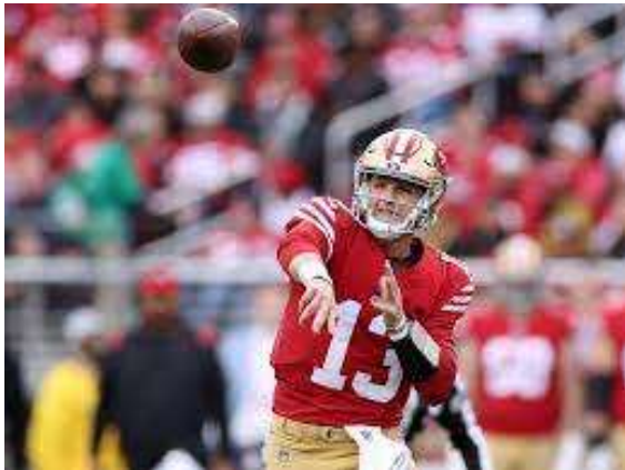
The Kid looks like Joe Montana, but it is still early

Rain will be a factor, as an Atmospheric River takes over Cali, so don't look for the Niners to win by double digits. They played poorly in the season opening monsoon in Chicago, but expect a conservative, hard hitting game. Geno turns the ball over at least once, and the Niners come away with the win in a low scoring affair. Niners.