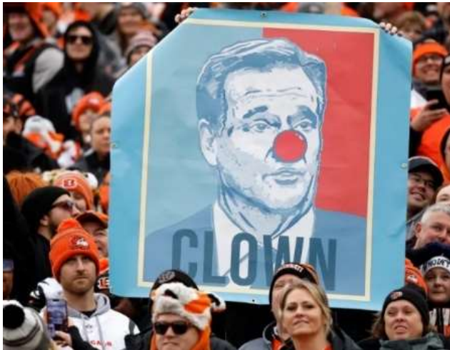
While Hamlin fought for his life, Roger Rabbit stewed

The 2022 NFL season came mercilessly to a close last week, and the postseason is upon us. About two thirds of the Week Eighteen games were meaningful courtesy of revised scheduling, and even the Browns-Stillers game had import. When the smoke cleared, Blitzburgh, Green Bay and Detroit went fishing, and Miami and Seattle snuck into the back door. The NFL got what it wanted: a number of solid matchups in the Wild Card Weekend.