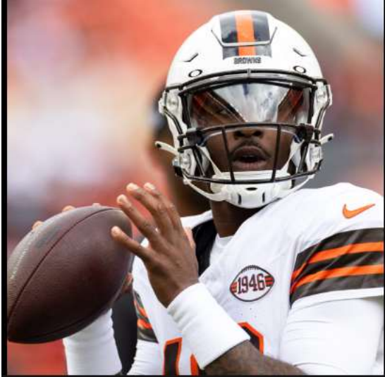
Turnover King PJ Walker is not “dyno-mite!”