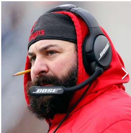
Peppermint Patty will not be back in Philly in 2024