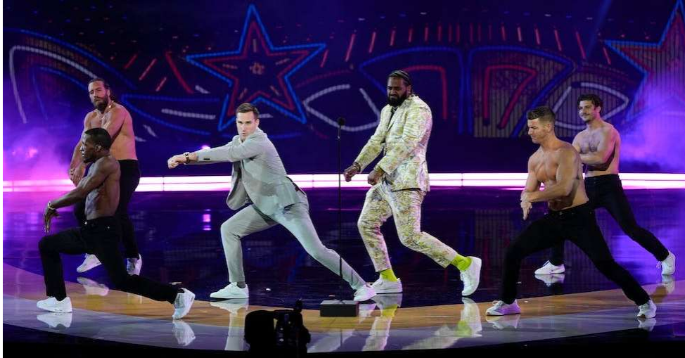
"What up Cuz? "