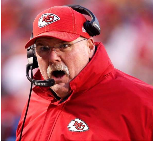
The MVC - "I gotta start locking this place up"