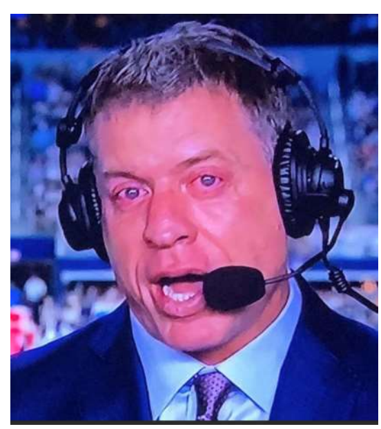
"...like an old man trying to send soup back at the deli..."