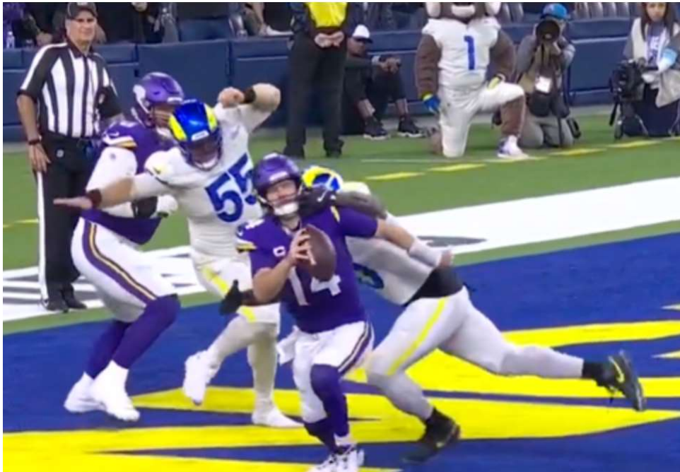
Darnold gets the Ken Anderson Exorcist treatment ala Halloween 1983

Darnold and the Hornheads would still have needed a TD and two-point PAT to tie the game, but this call was blatant. How is a personal foul on a scoring play (safety) not reviewable? Why did the League not call in and tell them to fix the call? And how is Keith Gary still playing after all these years? Burning questions all.