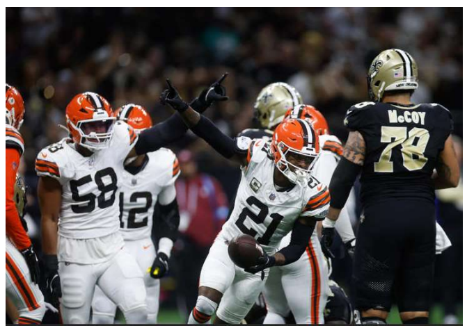
Great performance in Training Day...