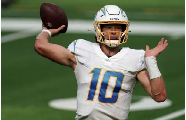
Can this man beat the presumptive MVP?

The Magic Eight Ball says "yes" as the Bolts attempt a run at the AFC West with a win. Bolts cover and win the Harbaugh Bowl, effing up the NFL's attempt to stack the deck for B-More. Bolts.