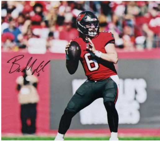
Cake is balling out in 2024, but will he have enough?