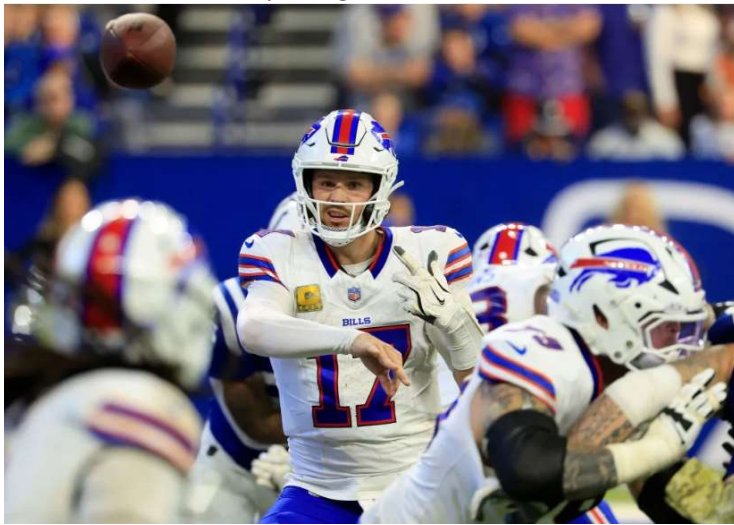
This man is playing mistake free ball