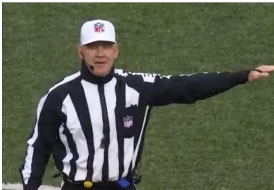
“Personal foul on Number 8, tickling the defender...”