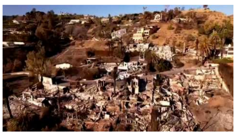
Devastation on a massive scale...

The Look Man doesn't understand the blame attribution here. The victims are not just Hollywood actors. The majority are hard-working Americans who lost everything. They don't need handouts, they need help. If you can contribute, please lend a hand.