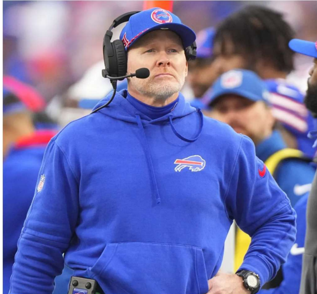
Bills Mafia hit on McD?

The Look Man doesn't see how Crapchester beats this rested Chowds squad. New England.