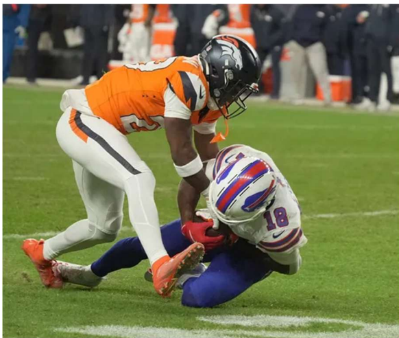
One knee = two feet...sometimes

The game pivoted on a controversial, but predictable play; the Brandin Cooks catch-INT. the play was further evidence that no one knows what a catch is anymore. Cooks clearly caught the ball and went down on a knee and back, but was unable to perform an act common to the game. In other words, he failed to take the football out to dinner, buy drinks, and use a condom afterwards.