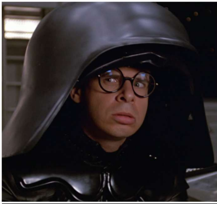
Dark Helmet doesn't like the hire...

So, the plan should be simple: get a LT, WR, and some other help in the 2026 draft, and figure out which way the galaxy blows in 2027. This rebuild cannot occur at Ludicrous Speed; it has to be deliberate and calculating irrespective of the HC.